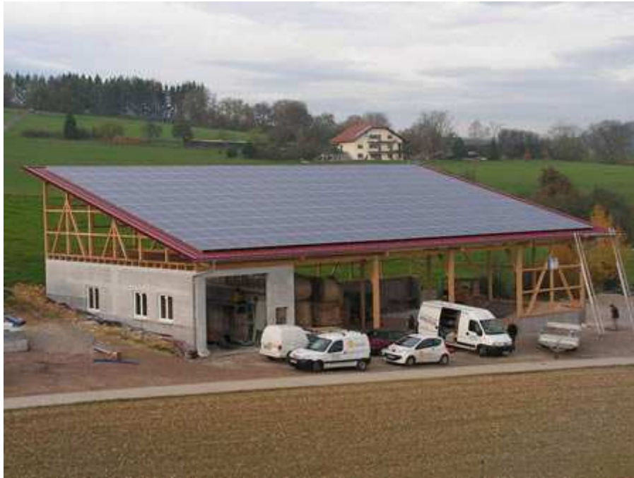
Citizen-financed photovoltaic system in Mauenheim

Through the involvement of the citizen-financed component of the project, a new 66 kW photovoltaic system was also established. The system provides over 60,000 kWh / year to the bio energy village. Together with an existing 260 kW of solar power capacity which supplied a quarter of Mauenheim's electrical use already, the solar systems alone produces nearly 4 times the town's electrical requirements.