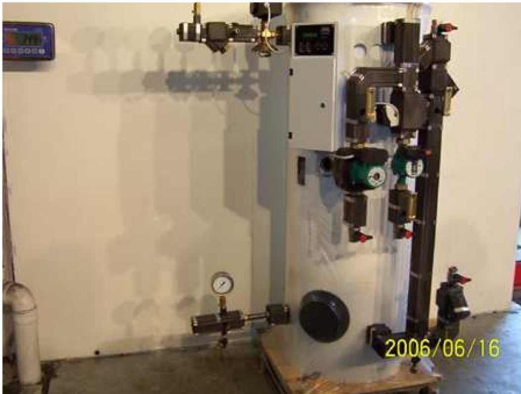
Heat transfer system consisting of a buffer tank, pump, regulator, and heat flow meter.