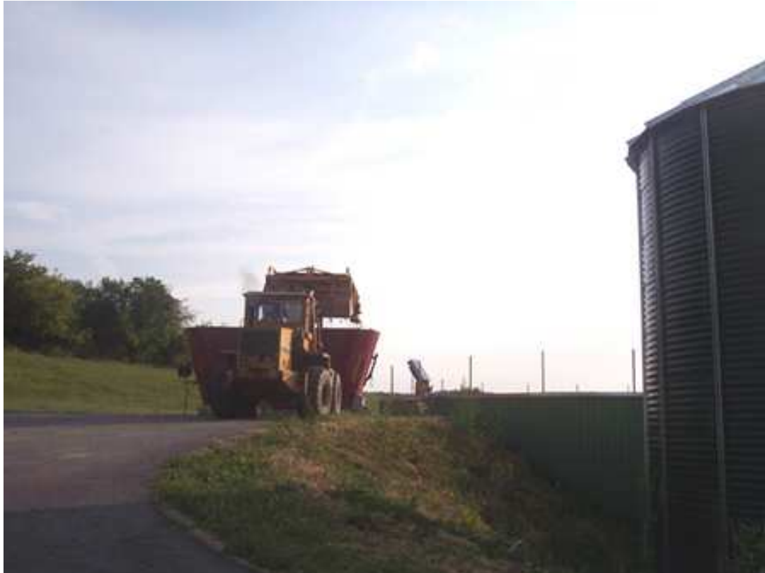
Daily addition of locally grown energy crops into the biogas dry-inputs unit