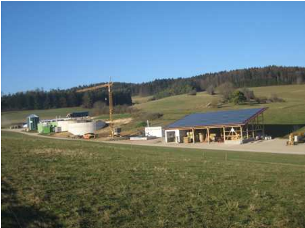
Biogas facility (in the building, woodchip heating system and solar power station)