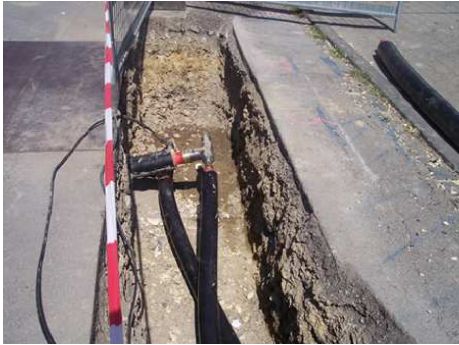
Local hot water supply line with T-fitting in the open ditch