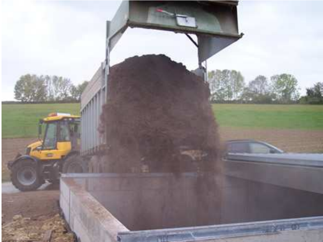
Wood woodchips are delivered into the storage bunker