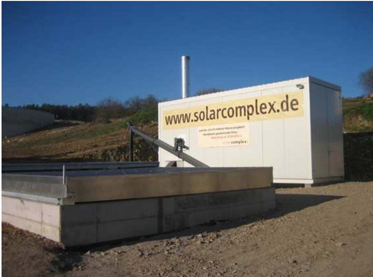
Woodchip shelter (foreground) and central heating installation in the container (background)